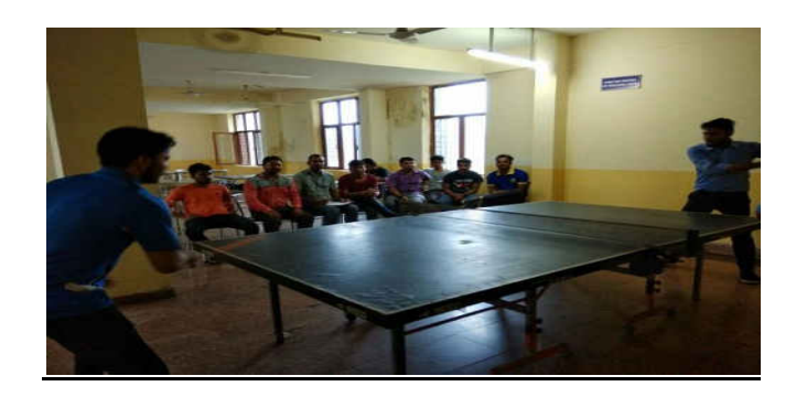
Table tennis match was organised successfully at maya institute of technology. Students played with full sportsmanship spirit.