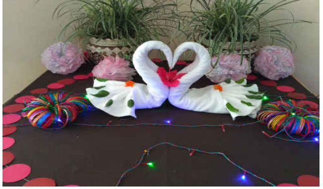
This activity has basically couple of objectives that the hospitality department always initiates in terms of event decoration and celebration as well as it is mentioned in the course outline of students that a practical learning exposure

Festivals can transform common days into special, turn routine job into joys and turn opportunities into blessings. Continuing on trend of the festive season celebration a student lead team was formed taking the responsibility for the decoration of the lobby of hotel Management department.